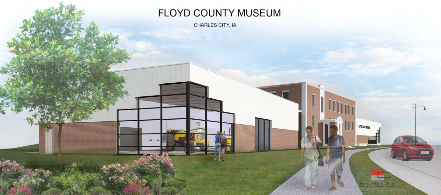
Proposed Minneapolis-Moline Addition